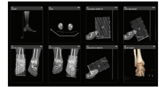
Series View Mode

Shows all the series within the study. Click on a series to display the images within that series in Image View Mode.