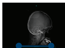
RULER AT BOTTOM