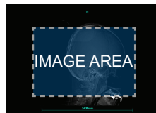
Image Area Controls

Double-click the Help Icon to turn on/off pop-up help that automatically shows available features where ever you hover the cursor.